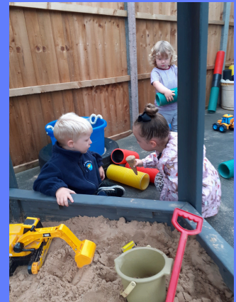
Anyone for ice cream?