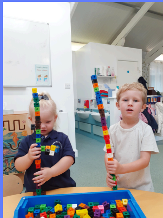
Which one is the tallest?