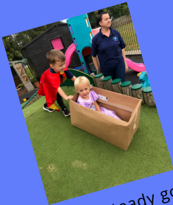
Ready, steady go.....