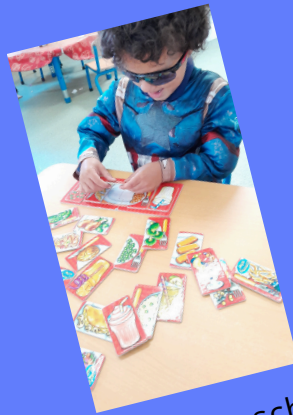
Too cool for school!