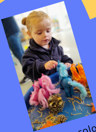
Counting, colours and a whole lot more learning opportunities